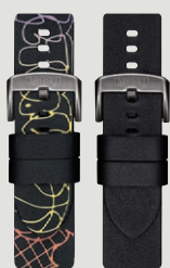
TISSOT CHRONO XL 3X3 BASKETBALL SPECIAL EDITION.